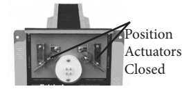
Position Actuators Closed