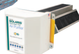
SLX-AAL-CAT Carbon Capture PCO

Solaris PCO air purifiers have an industry leading ability to remove odors, VOCs, and airborne microbes.