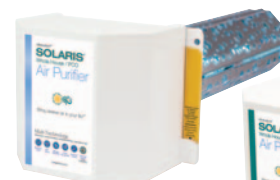
SLX-AAL-PCO Active Adjustable PCO

Germicidal UV lights with T3™ technology for 40% more UV